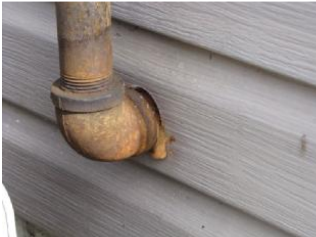
Gas line needs caulking.