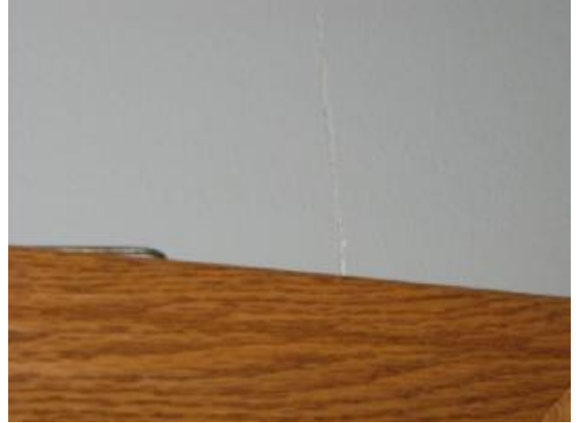
Crack in drywall.