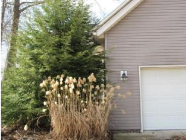
Tree requires cutting back.