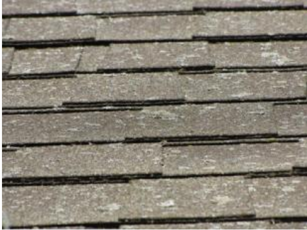
Fungus growing on shingles.