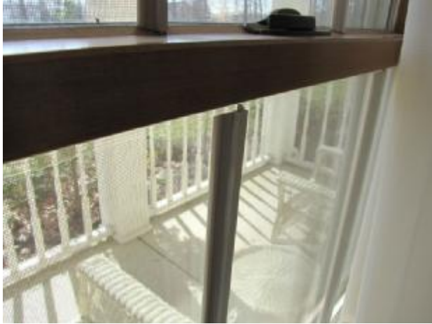
Window divider (muntin) is broken.