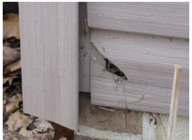
Vinyl siding cracked.