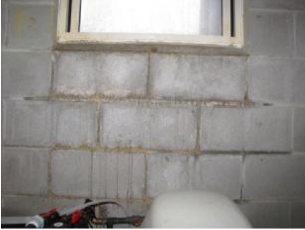
Water leak around window.