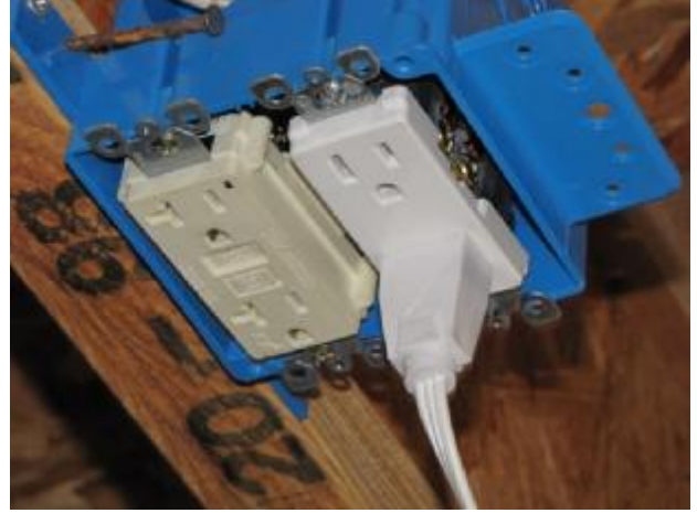
Outlet missing cover.