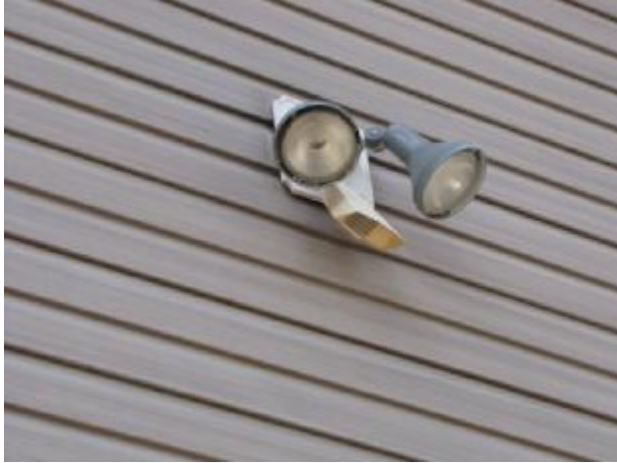
Broken security light.