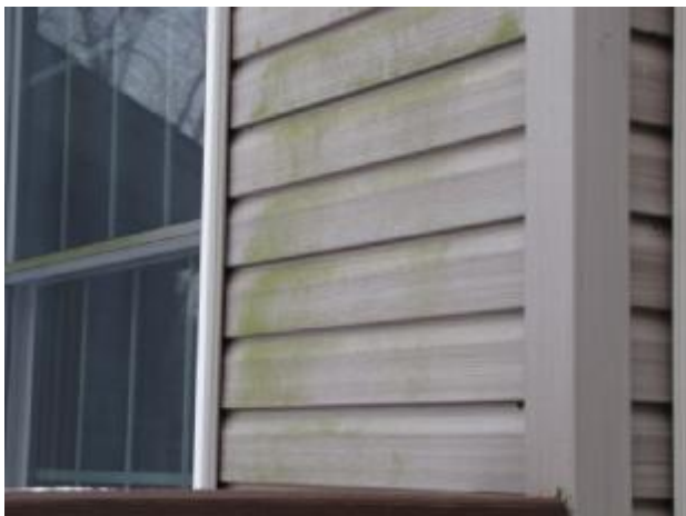
Fungus on vinyl siding.