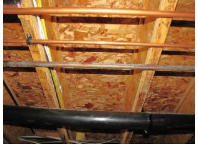
Condensation on pipes.