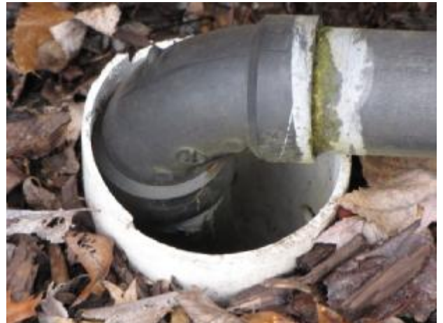
Cap missing on sump pump drain.