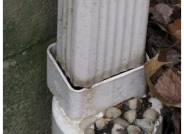
Down spout too short.