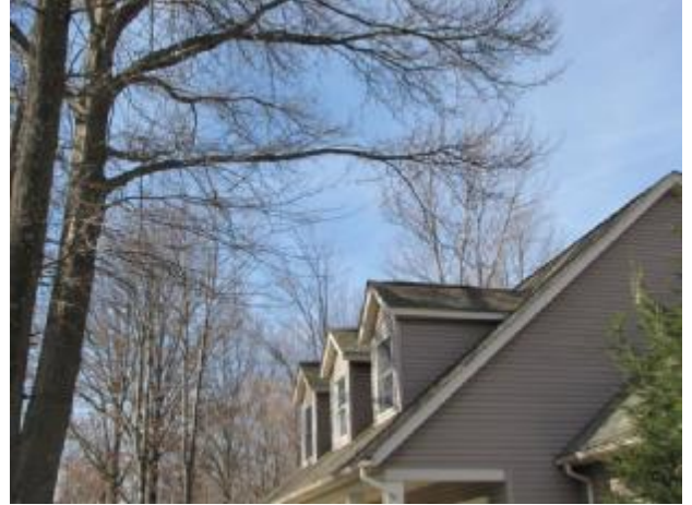
Tree requires cutting back.