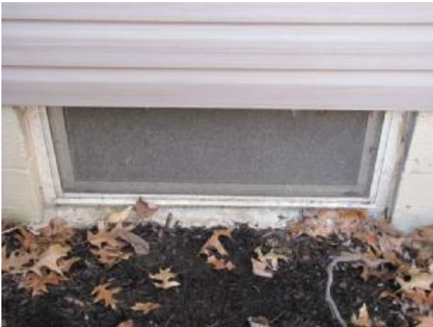
Landscaping is sloping toward basement window.