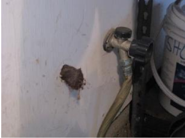
Hot water spigot missing in garage.