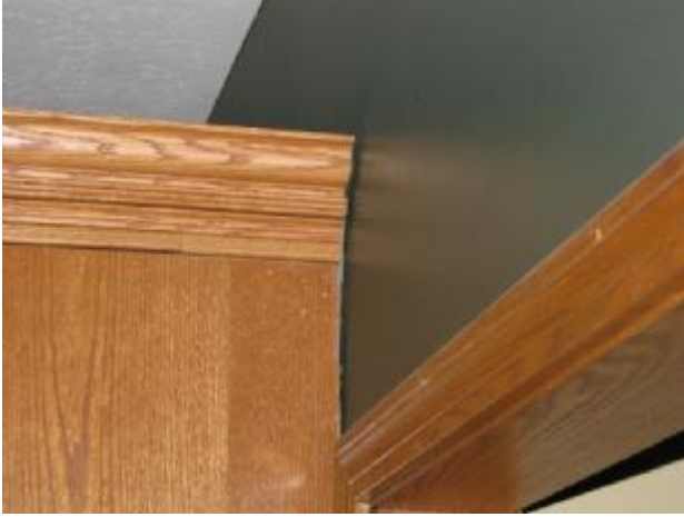
Cabinet pulling away from wall.