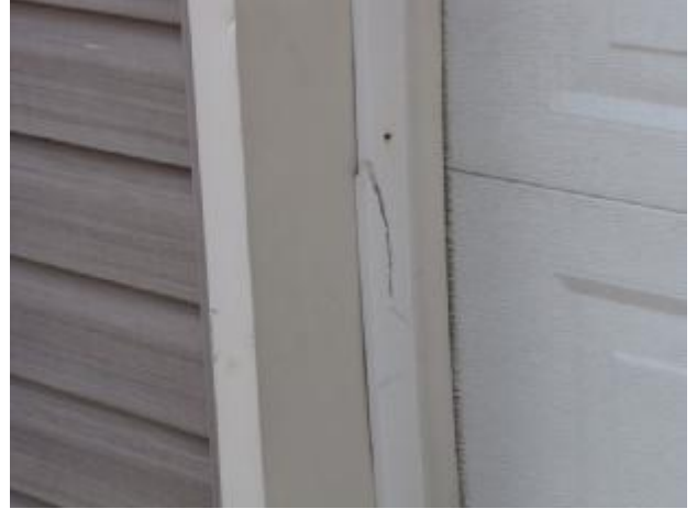
Cracked door trim.